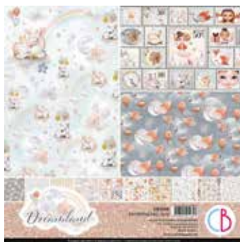
CBT058 Patterns Pad 12x12"