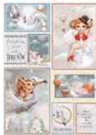
CBCL058 Creative Pad A4