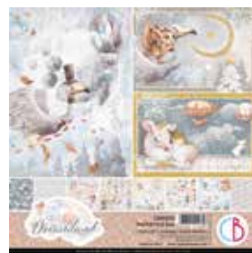
CBH058 Paper Pad 8x8"