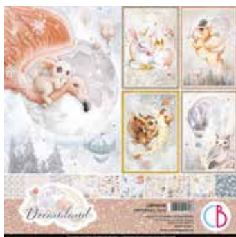
CBPM058 Paper Pad 12x12"