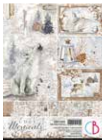
CBCL056 Creative Pad A4