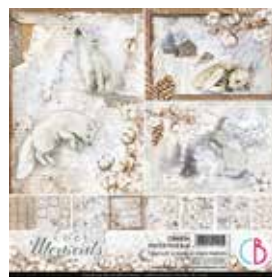
CBH056 Paper Pad 8x8"