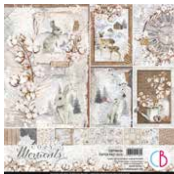
CBPM056 Paper Pad 12x12"