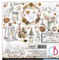
CBQE056 Fussy Cut Pad 6x6"