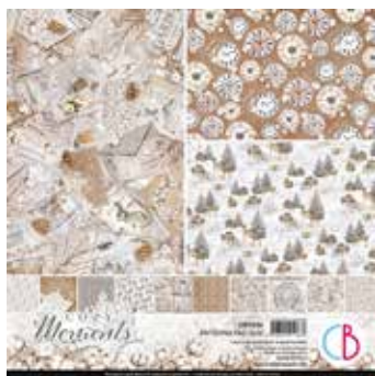
CBT056 Patterns Pad 12x12"