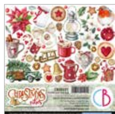
CBQE057 Fussy Cut Pad 6x6"