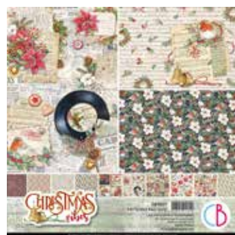
CBT057 Patterns Pad 12x12"