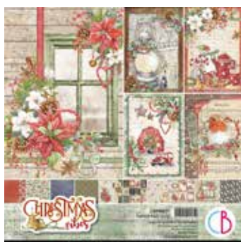
CBPM057 Paper Pad 12x12"