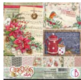
CBH057 Paper Pad 8x8"