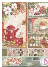
CBCL057 Creative Pad A4