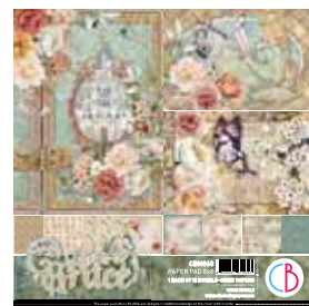
CBH060 Paper Pad 8x8"