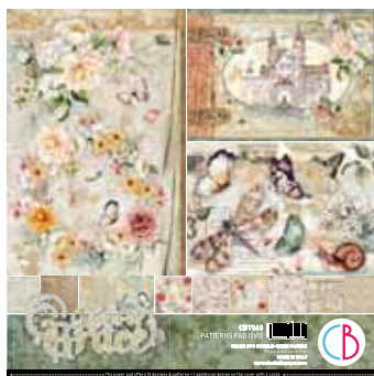
CBT060 Patterns Pad 12x12"