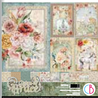
CBPM060 Paper Pad 12x12"