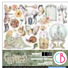
CBOE060 Fussy Cut Pad 6x6"